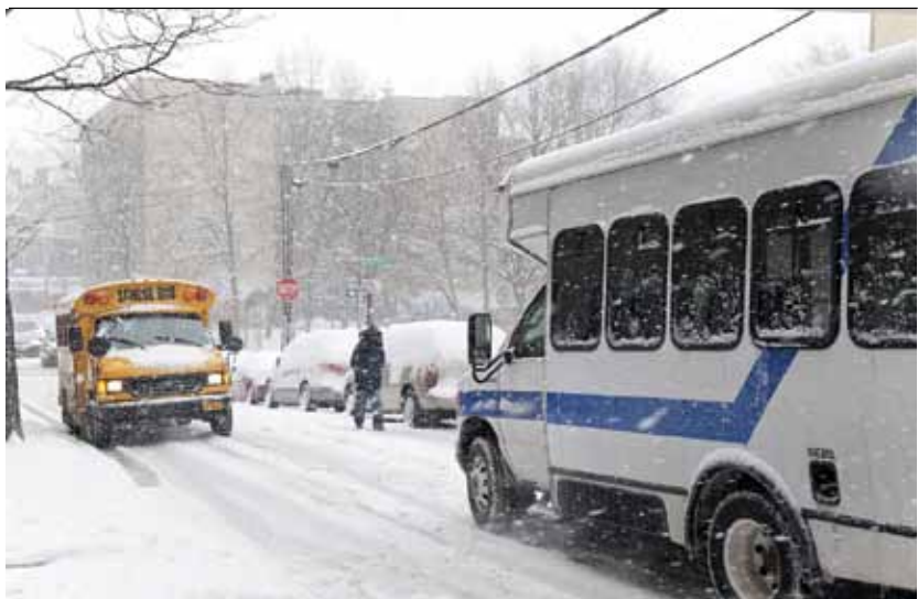
Bronx, New York, snow storm in 2014.

Several hypotheses for how Arctic warming may be influencing mid-latitude weather patterns have been proposed ( look at a list of hypotheses ). For example, Arctic amplified warming could lead to a weakened jet stream, resulting in more persistent weather patterns in the mid-latitudes. These linkages are the subject of active research. However, many workshop participants noted that research on the Arctic influence on mid-latitude weather is still young, making it difficult