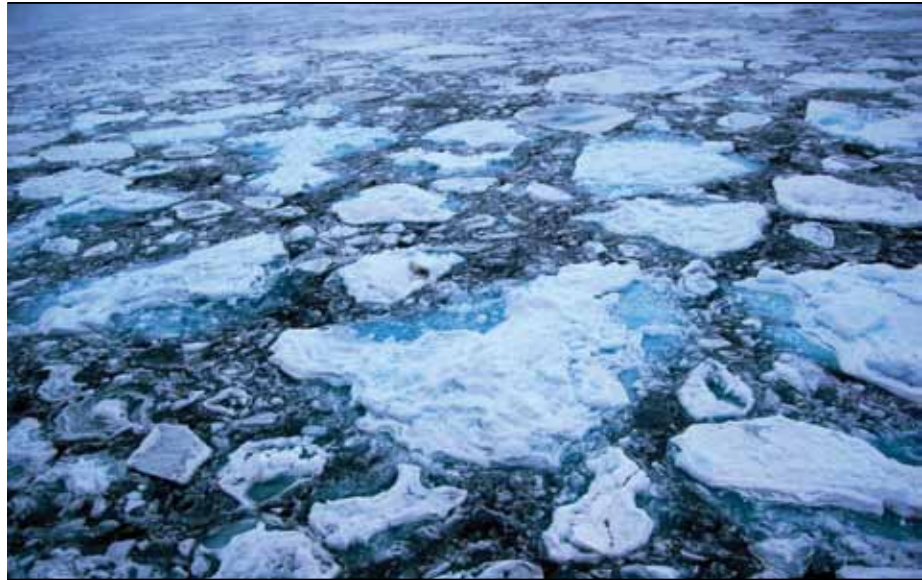
Summer in the Arctic.

Given the far-reaching societal impacts of changes in our climate system and the speed at which the Arctic sea ice cover is disappearing, many participants