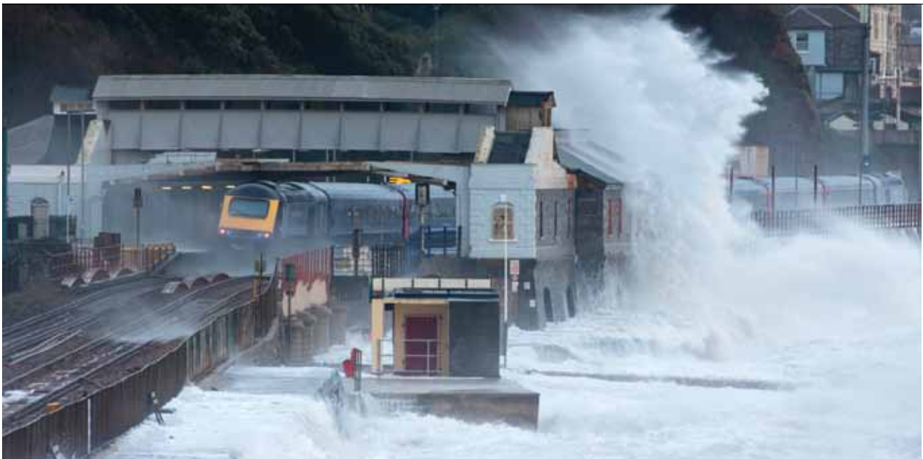
Dawlish, Devon, England, storm in 2014.