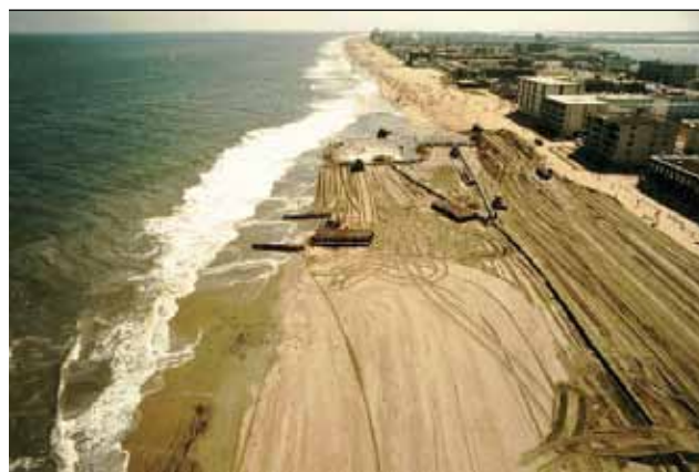
Beach nourishment projects repair erosion while increasing the distance between vulnerable coastal infrastructure and breaking waves, while dunes protect against wave energy and flooding.