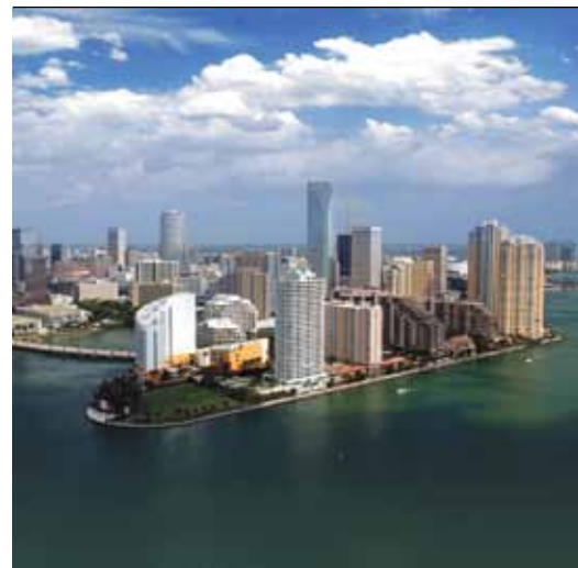
Miami ranks 2nd on a list of the world's cities with the most to lose (potential for average annual losses) to coastal flooding.

Responsibilities for coastal risk reduction are spread across numerous agencies and all levels of government, each driven by different objectives and authorities, with