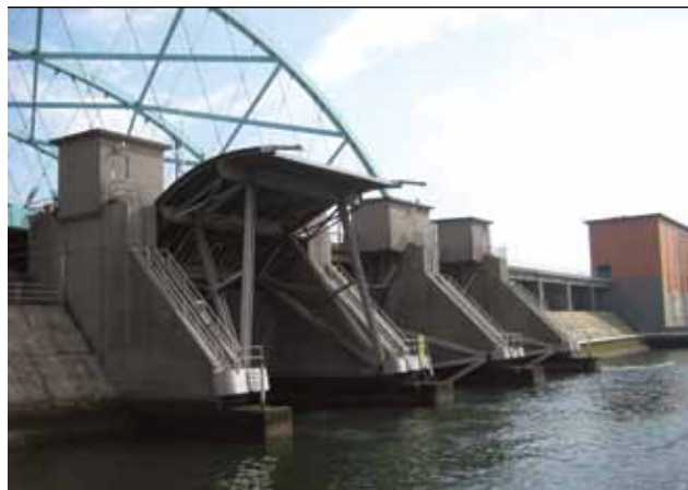
Hard structures like this Fox Point Hurricane Barrier in Providence, Rhode Island, are likely to become increasingly important to reduce coastal risk, particularly in urban areas where there is not enough space for nature-based strategies.

The report considers two approaches: (1) a risk-standard approach that recommends investments to achieve an acceptable level of risk reduction, such as reducing the threat of loss of life or the probability of severe flooding; and (2) a benefit-cost approach that recommends investments when the benefits of the investment exceed the costs. The report concludes that a benefit-cost approach, constrained by acceptable risk provides a reasonable framework